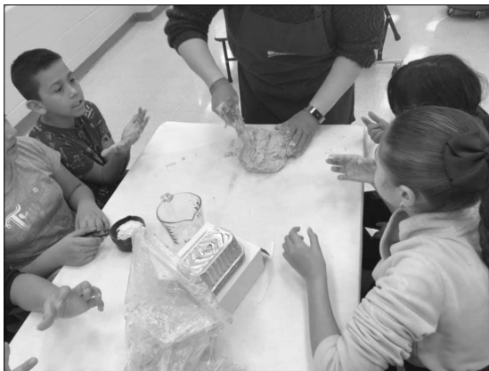
Riverside 5th grade students watch as their bread dough is prepared for them to knead.