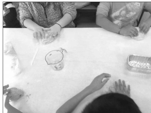
Students at Riverside Elementary kneading their bread dough.